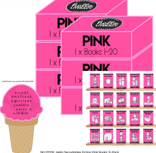
SKU P1206 Hello Decodables Fiction Pink Books - 6-Pack