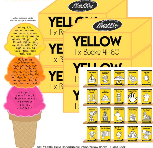
SKU Y41606 Hello Decodables Fiction Yellow Books - Class Pack