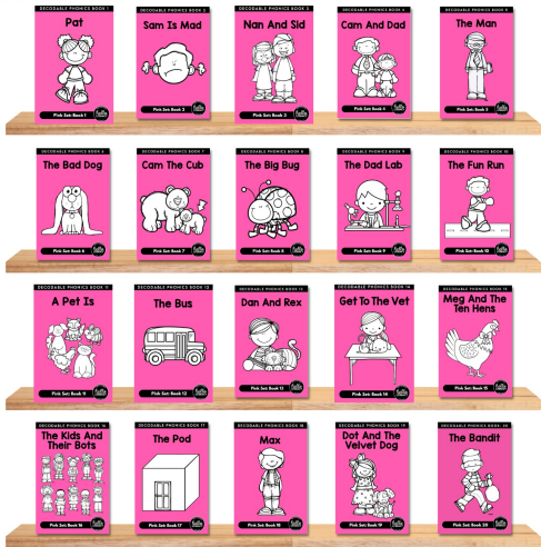
SKU P1201 Hello Decodables Fiction Pink Books - Individual Set