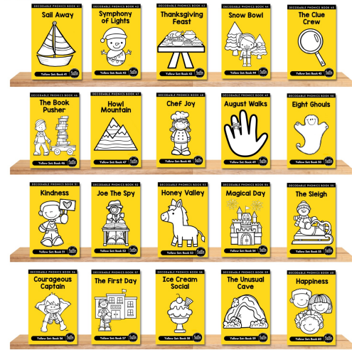
SKU Y41601 Hello Decodables Fiction Yellow Books - Individual Set