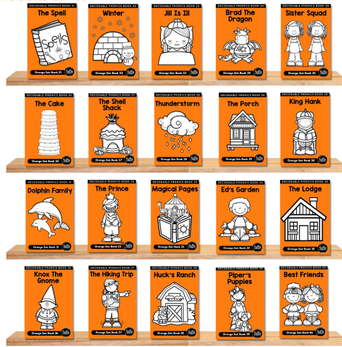
SKU Q21401 Hello Decodables Fiction Orange Books - Individual Set